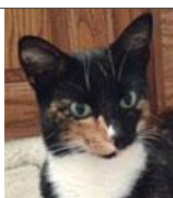
The Modisett Family 631 Norfleet Rd. NW Atlanta, GA 30305