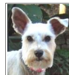
The Hicks Family 34 Blue Mountain Jasper, AL 40628

Unlike regular luncheon events, the fundraiser festivities will begin at 10:00 to allow time for visiting with friends as well as viewing and bidding on the silent auction and raffle items. The silent auction closes at 11:45 to allow seating for lunch at 12:00 and the processing of the bids.