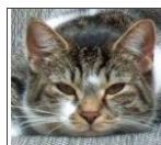
The Zino Family 53 Jessica Place Marietta, GA 30062

REMINDER: Bring some address labels with you to put on the back of your raffle tickets so you don't have to write your name on each one; it also makes it much easier to read your name during the raffle.